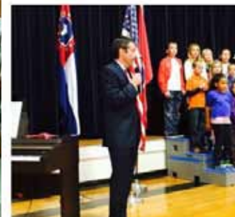
Veteran's Day at Pleasant View Elementary School

Top 10 markets for first-time homebuyers featured on FOX NEWS naming PLEASANT VIEW!