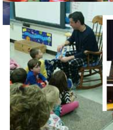
Bedtime Stories at Pleasant View Elementary School