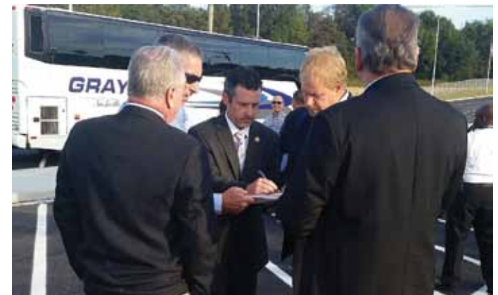
T.D.O.T. Commissioner and top executives discussing road projects in Pleasant View with your Mayor.